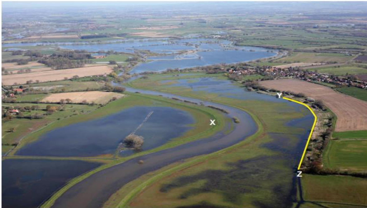
A river flooding

(b) Describe the features of the flooding shown in Fig. 1.1. [3]