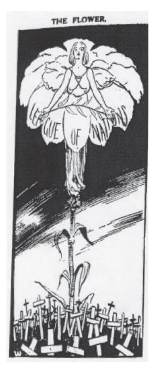
A British cartoon published in November 1919.